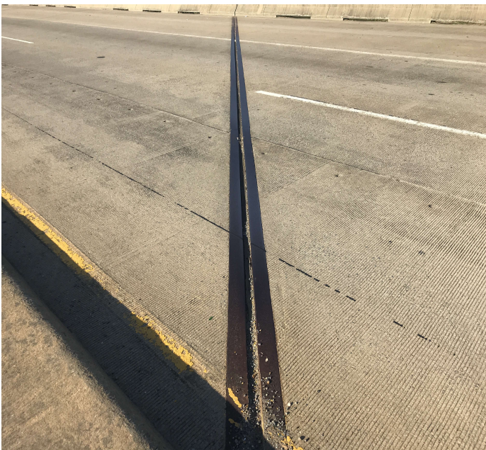
PHOTO 1 Description Glue along closed cell joint has lost its bond and is leaking.